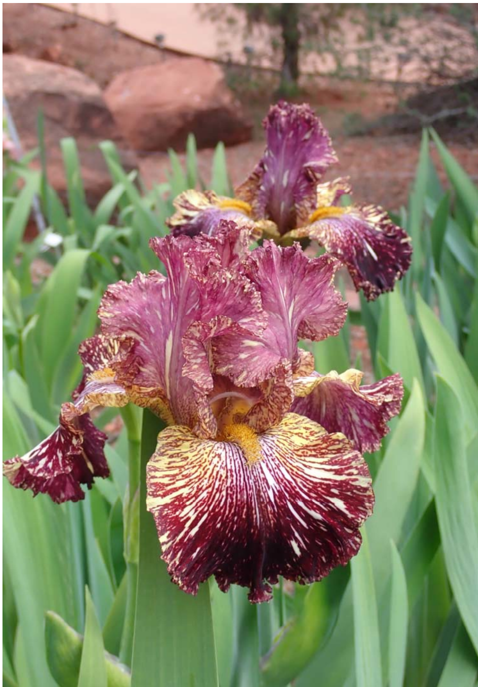
'Bewilderbeast' - TB 30" M 1995 - B. Kasperek