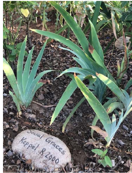
Increases I am growing for the club.