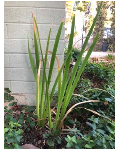
Louisiana's don't seem to mind the heat