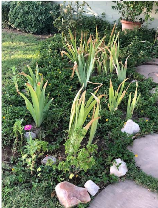
Fans with brown tips. Ground cover is Wedelia, dies back in winter, keeps soil shaded in summer