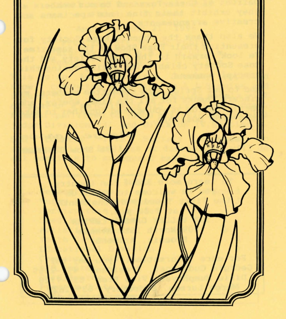
April 20 and 21, 1996