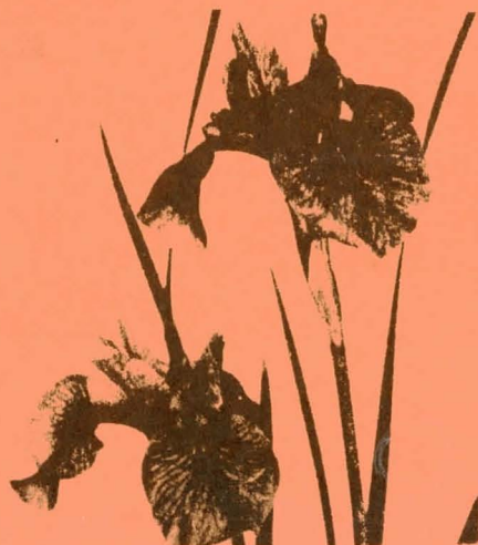
SWANK - Morgan Award '73